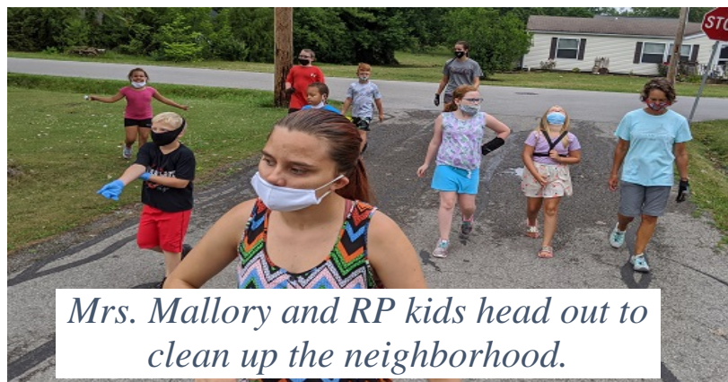
Mrs. Mallory and RP kids head out to clean up the neighborhood.