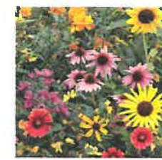
Bird & Butterfly Wildflower Mix

A blend of annual and perennial flowers that provide nectar & pollen to wild bees, honey bees & other pollinators. Blooms early summer to fall. 4 oz. poly bag seeds approx. 1,350 square feet.