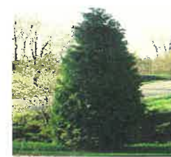
American Arborvitae (White Cedar) A dense, flat green pyramidal tree. It has feather-like yellowish-green needles with blunt tips. Has a medium growth rate & grows 40-60-ft. high, useful as a windbreak & wildlife habitat.