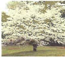
Flowering White Dogwood

Needles are stout and prickly. 3/4-1-1/4 inches long, rich green to bluish green. Moderate growth rate.