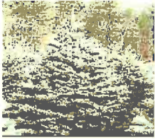
Colorado Blue Spruce

Needles are stout and prickly. 3/4-1-1/4 inches long, rich green to bluish green. Moderate growth rate.