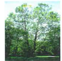
American Sycamore One of the biggest, sturdiest & most durable of North America hardwoods. It's the most striking feature is its unique bark, resembling the camouflage of a soldier's uniform. Height: 80-100 ft. Does well in most soils.