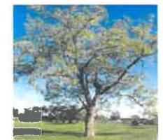
Black Walnut One of the most valuable native trees. Heavy, strong, durable heartwood, in great demand for veneers, cabinet making. Nuts are eaten by humans & wildlife 70-100 ft.