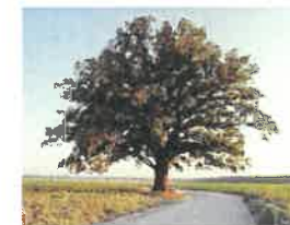
Bur Oak A massive, majestic Oak and native to Ohio. May reach 90 ft. tall and 80 ft. wide. Large, leathery leaves. Deer enjoy the acorns the Bur Oak produces.