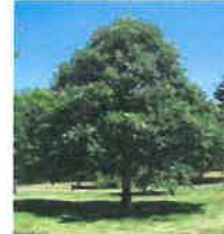
Swamp White Oak

A native tree that has dark green foliage turning yellow to orange to fiery red in fall. Grows in most types of soils. The sap is used to make maple syrup. Slow to medium growth. Ht: 40-60 ft.