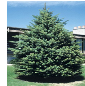
Black Hills Spruce

The cinnamon-colored bark of the River Birch is spectacular in the winter. Lustrous, medium-green leaves. Tolerant of both wet soils & dry summers. Medium to fast growth rate. Height -40' to 70'. 40'- 60' spread.